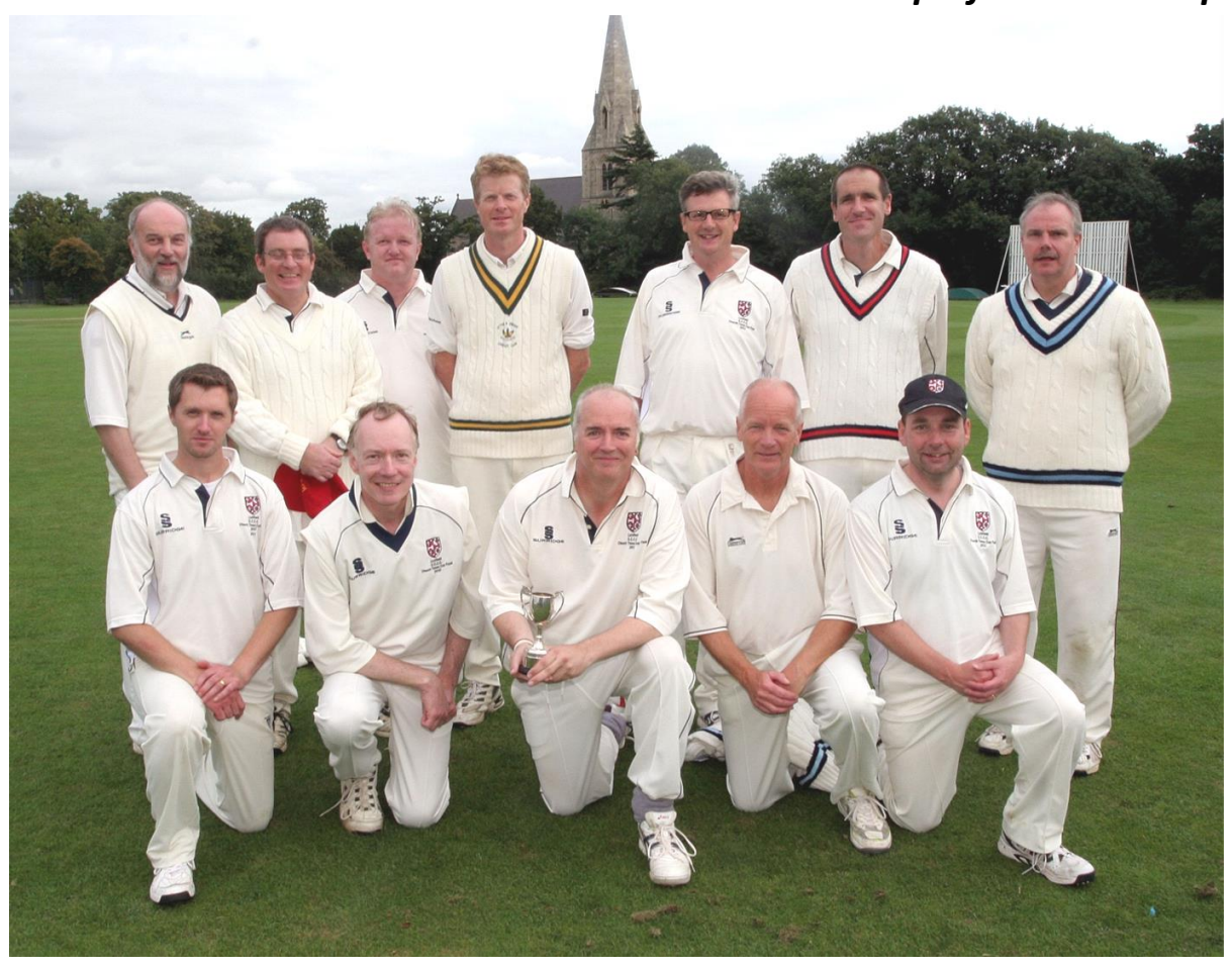
+ Clive Gregory Bishop of Wolverhampton

Our dressing room has been a place where we have tried, not always successfully, to treat triumph and disaster just the same. It has been a place of support, encouragement and friendship, and on occasions, good disagreement. A place where theological differences can be aired and respected, without bats disappearing though windows. On a good day, in the aftermath of a good win, where everyone has been able to contribute, it has felt a special privilege to be part of that Body, diverse but unified, joyful, if rather sweaty. As one in our sense of purpose, but fully aware that for each of us, there is a greater goal, a higher purpose, even than winning the Church Times Cup. How special it is to share that bond with one another, and with all those who have faithfully supported us over the years.